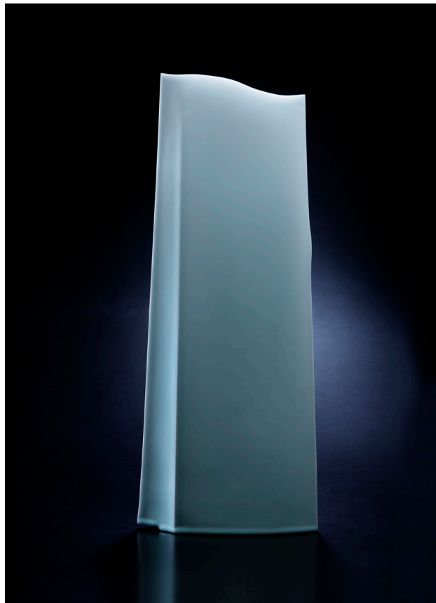
Kiyoki no Omoi V (Pure Imagination V), Sueharu Fukami.

Everything that is beautiful is always in balance. With balance, you get a sense of peace.