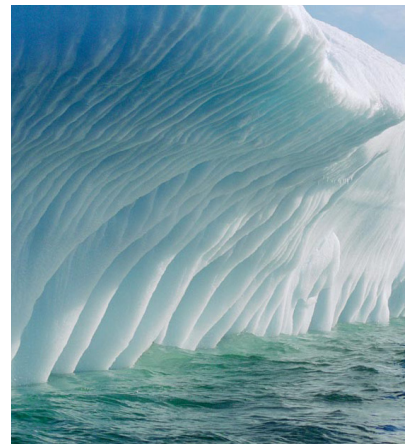
Untitled photograph, Ice Cycles Series by Jean Vollum