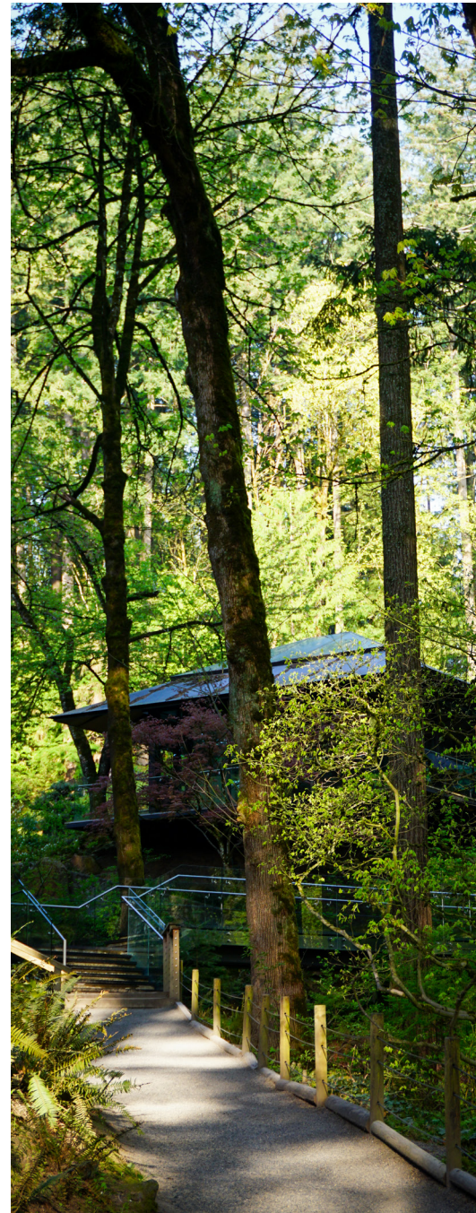
The Entry Garden, an element of Portland Japanese Garden Testut and Rudin especially enjoy. Portland Japanese Garden

"The path through the Entry Garden is brilliant," Rudin added. "It is a transition from the busy world to the peaceful world, to a calm world where you have a chance to down regulate into a different frame of mind before you even get to the rest of the Garden. If you just walked through a portal and -bam- you're in Portland Japanese Garden, it would not be quite the same."