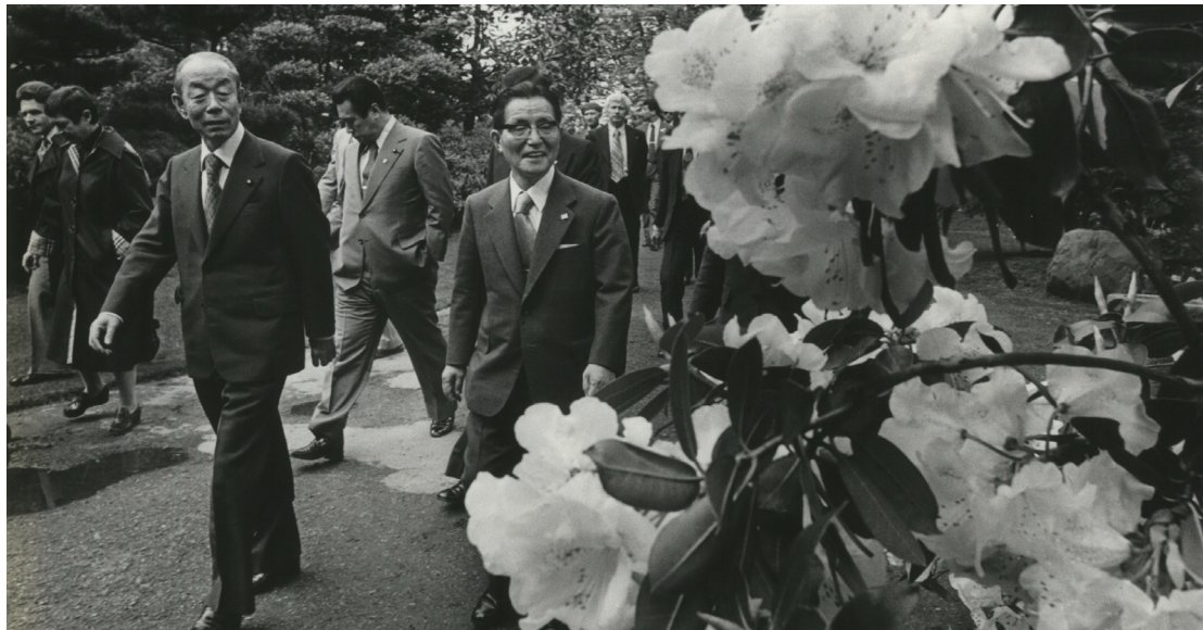
Japan Prime Minister Takeo Fukuda walks through Portland Japanese Garden during his 1978 visit.

Portland Japanese Garden’s reputation as “the most beautiful and authentic Japanese garden in the world outside of Japan” is one that has been burnished over the decades by the many dignitaries from Japan who have walked its grounds. To have earned this reputation is something the Garden cherishes and does not take for granted. Here are a few of the notable dignitaries who have had a presence here in Portland, presented in chronological order.