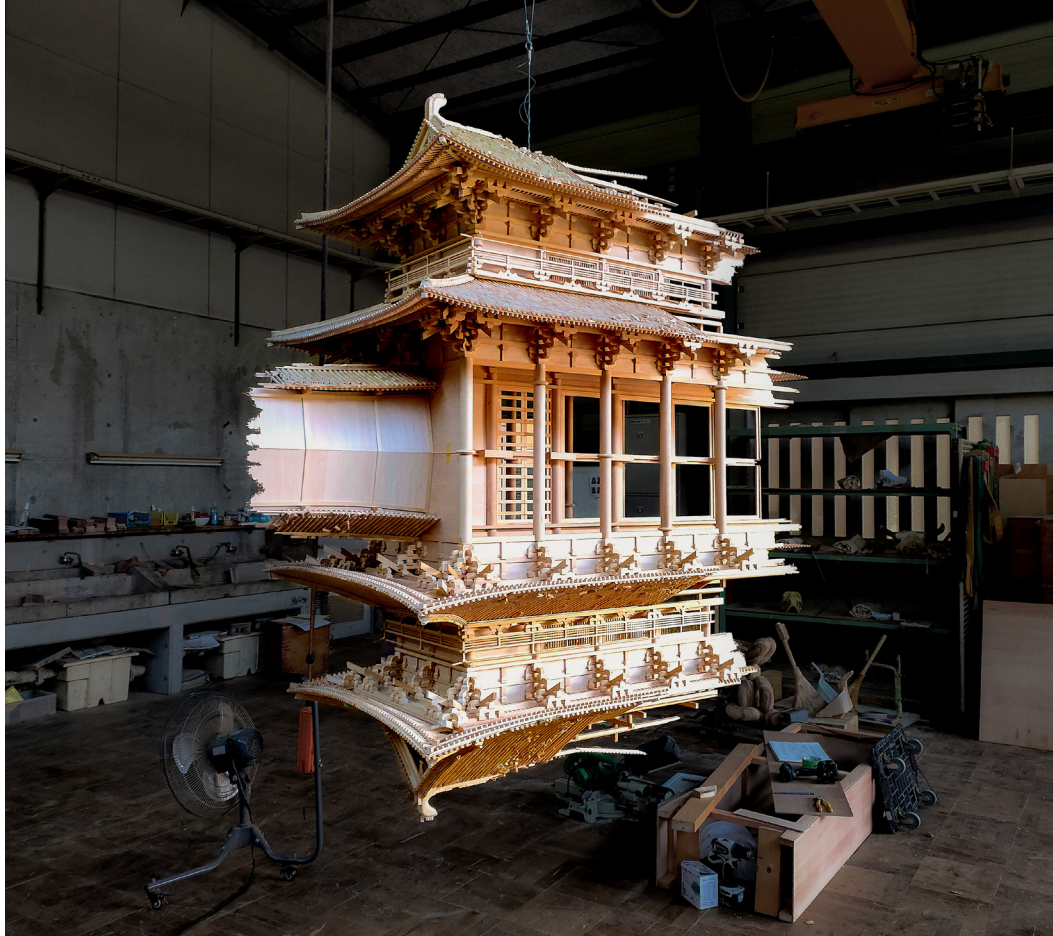
Preview from Iwasaki's studio: Reflection Model (Rashomon) , 2023 Takahiro Iwasaki