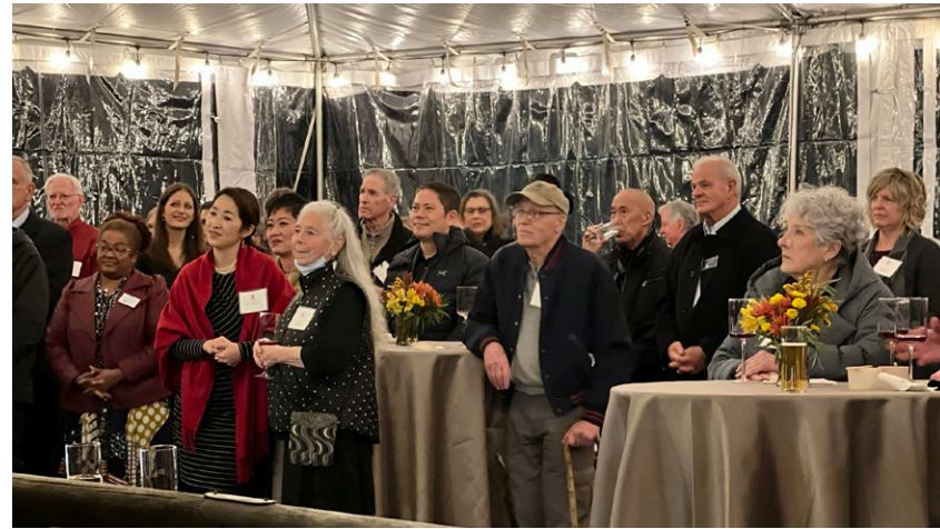
Golden Cranes celebrate the opening of the Ukiyo-e to Shin Hanga art exhibition