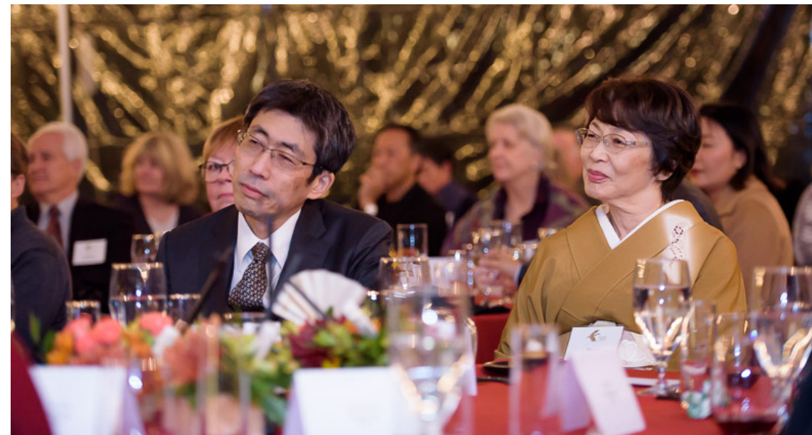
Consul General of Japan in Portland Masaki Shiga and Hiroe Shiga enjoy a koto and cello duet at Night of 1,000 Cranes