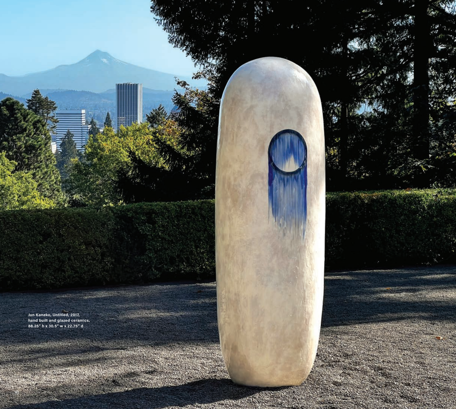
Jun Kaneko, Untitled, 2017, hand built and glazed ceramics, 88.25" h x 30.5" w x 22.75" d