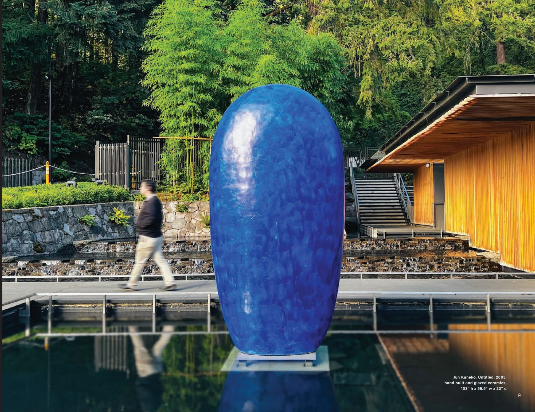
Jun Kaneko, Untitled , 2005, hand built and glazed ceramics, 103" h x 55.5" w x 23" d

The first sculpture you encounter when approaching the Garden embodies Kaneko's taste for experimentation. Placed in the fountain near the Tanabe Welcome Center, the work looms like a prehistoric monolith made of crystallized rock. As the spectator approaches, the sculpture's reflection in the fountain doubles the work's presence. The towering shape feels foreboding and intimate at the same time. The surface at once looks solid and liquid, like cascading water. By firing the work in a large industrial kiln used for making pipes, Kaneko injected the glaze with wavy gradations that almost seem to capture the fire's movement across the surface. The effect is striking from near and afar.